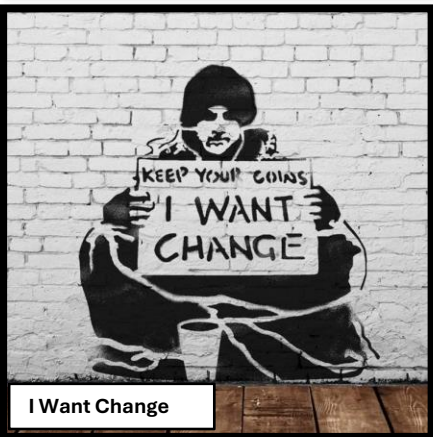
I Want Change