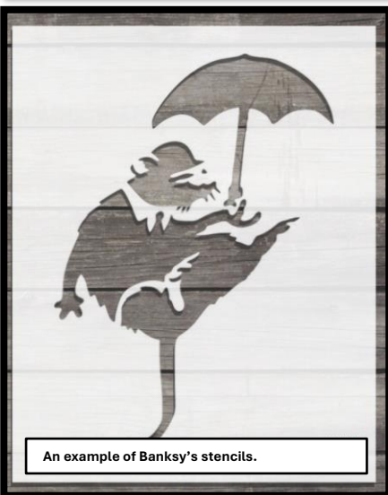
An example of Banksy's stencils.