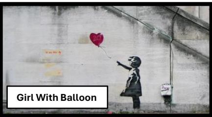
Girl With Balloon