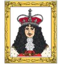
Samuel Pepys Christopher Wren King Charles II