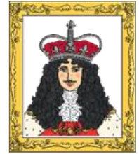
Samuel Pepys Christopher Wren King Charles