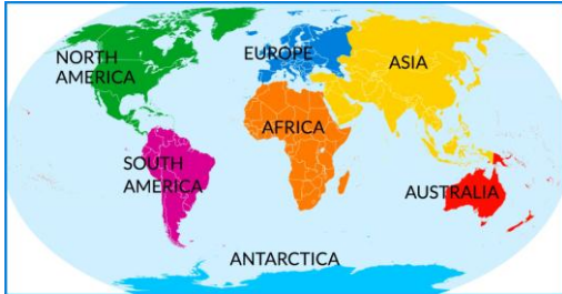
The continent of Europe in blue

What are some of the key physical features of the Mediterranean compared to the UK?